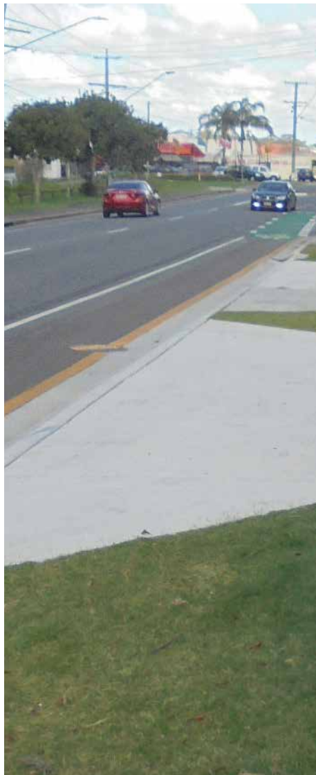
Example of parking pad

Vehicles parking partially on parking pads where any part of the vehicle overhangs or obstructs access to a formed footpath may receive an infringement notice.